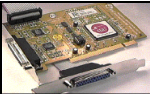
PCI Dual Parallel Card Shown