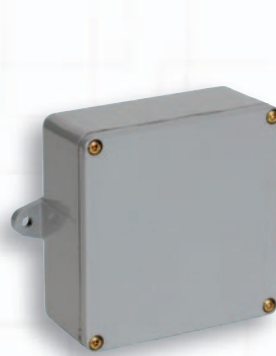
5x5x2 with (2) molded mounting feet