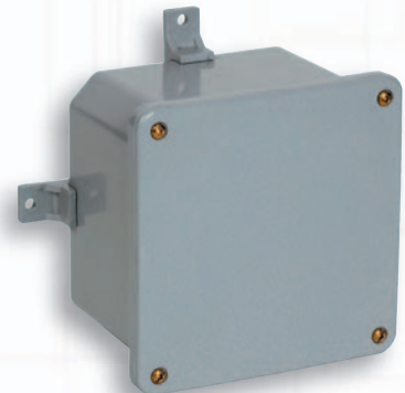
6x6x4 with (4) assembled molded mounting feet